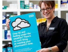
'Under the weather'