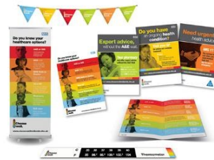
'Choose well' (West Midlands region)

of Health, the NHS Monitor are campaigns